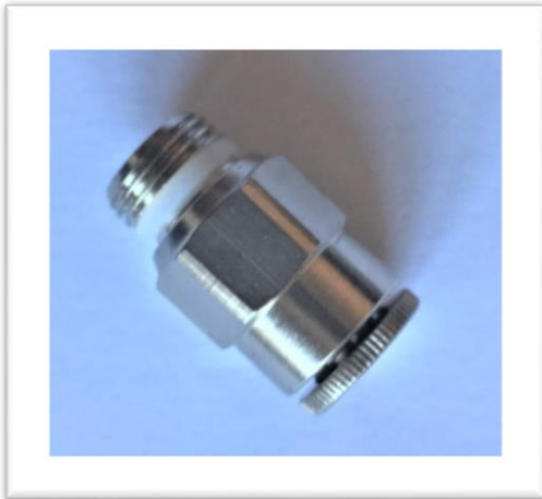
← QUICK COUPLING 1/8 4.