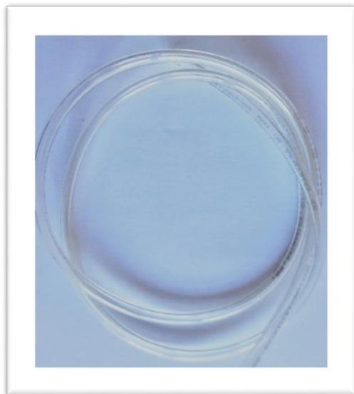
← RITZEN TUBE 6x4 6.